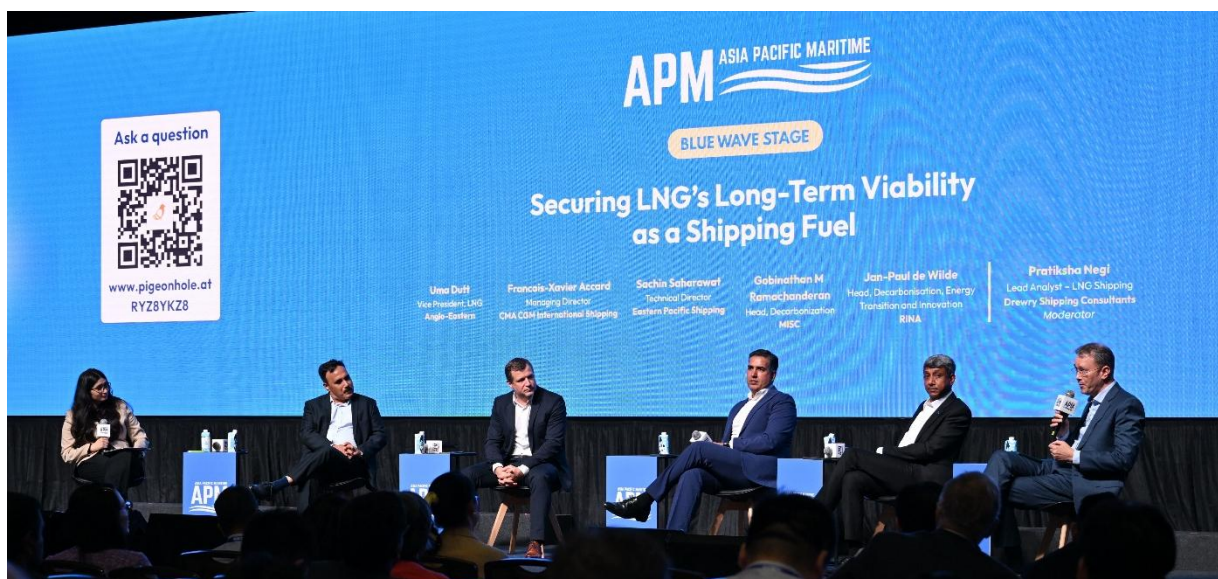
Industry experts at the APM 2026 panel: Securing LNG’s Long-Term Viability as a Shipping Fuel.